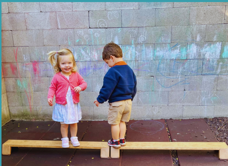
New balance beam in Wildflower