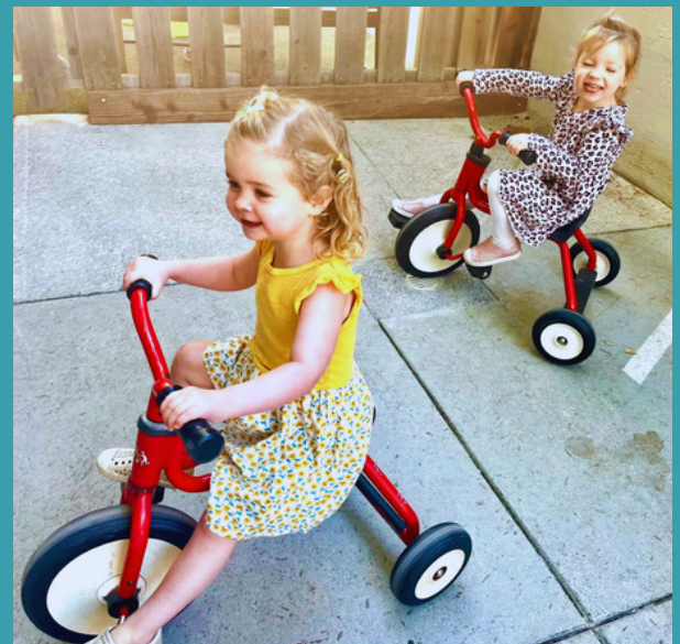
New bikes in Wildflower