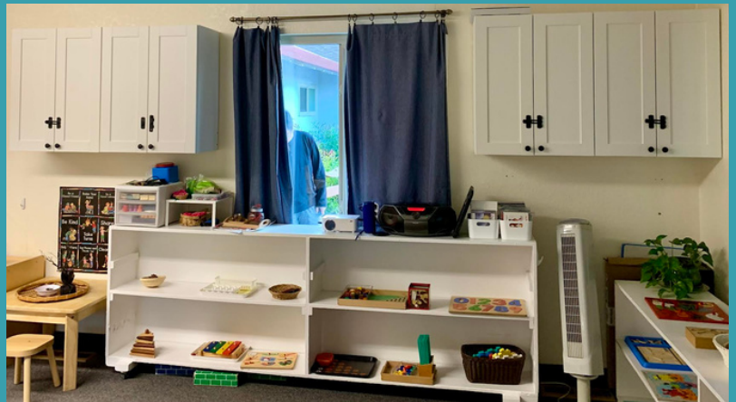
New cabinets in Wildflower

Thanks to the 2023 Auction, classrooms received much needed supplies to refresh and rejuvenate their environments.